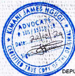
DEPUTY VICE-CHANCELLOR (ACADEMIC AFFAIRS)