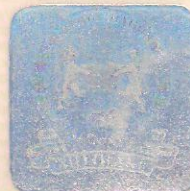
Chairman Kenya National Examinations Council