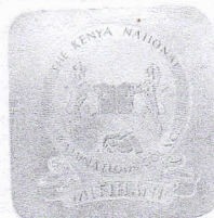
Chairman Kenya National Examinations Council