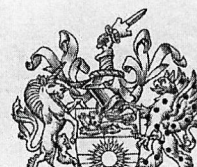
C Humphries Director-General The City and Guilds of London Institute