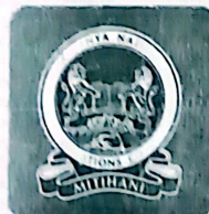
Chairman Kenya National Examinations Council

This is a secure document printed using special paper and inks. Please hold it up to the UV light to verify that the word BARAZA LA MITIHANI and the "ORIGINAL" embedded thread can be seen through the paper. Not valid without a hologram.