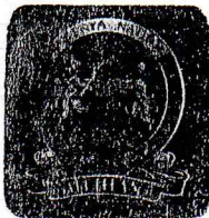
Chairman Kenya National Examinations Council

This is a secure document using special paper. Please hold it up to the light to verify that the word MITIHANI can be seen through the paper.