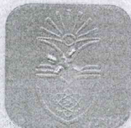
Deputy Vice-Chancellor (Academics, Research and Students)