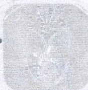
Deputy Vice-Chancellor (Academics, Research and Students)