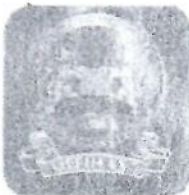
Secretary Kenya National Examinations Council