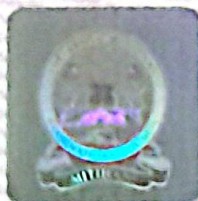
Chairman Kenya National Examinations Council

This is a secure document printed using special paper and inks. Please hold it up to the UV light to verify that the word BARAZA LA MITIHANI and the "ORIGINAL" embedded thread can be seen through the paper. Not valid without a hologram.