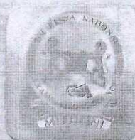
Chairman Kenya National Examinations Council

Certified True Copy of Original Senior Resident Magistrate Kikuyu Date 22/7/2024