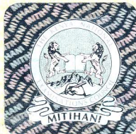
Chairman Kenya National Examinations Council