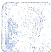
Chairman Kenya National Examinations Council

This is a secure document using special paper. Please hold it up to the light to verify that the word MITIHANI can be seen through the paper.