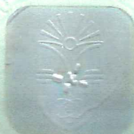
Deputy Vice-Chancellor (Academics, Research and Students)