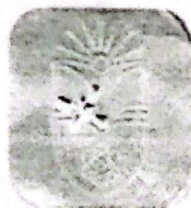
Deputy Vice-Chancellor (Academics, Research and Students)