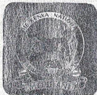
Secretary Kenya National Examinations Council

CTWO nshe 7/12/22 DIRECTOR QUALITY ASSURANCE AND STANDARDS MINISTRY OF EDUCATION P.O. Box 30426 - 00100 TEL: 318581 NAIROBI