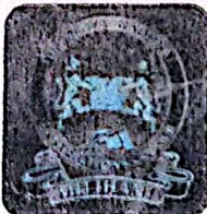
Secretary Kenya National Examinations Council

This is a secure document using special paper and inks. Please hold it up to the light to verify that the word MITIHANI and the "GENUINE" embedded thread can be seen through the paper. This document is not valid without a hologram.