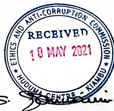
Chairman Kenya National Examinations Council

This certificate was issued without any alteration whatsoever. See overleaf for grades and mark intervals.