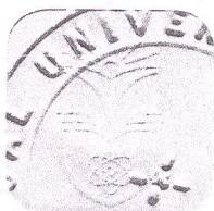
Deputy Vice-Chancellor (Academics and Students Affairs)