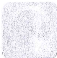
Chairman Kenya National Examinations Council