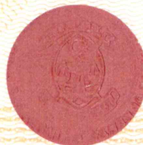
Secretary to Council