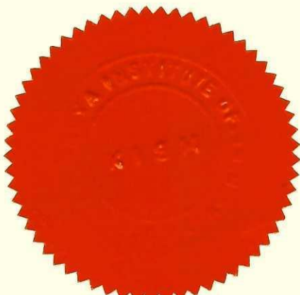
Chairman of Council

This Licence is valid until the 31st day of DECEMBER 2021.